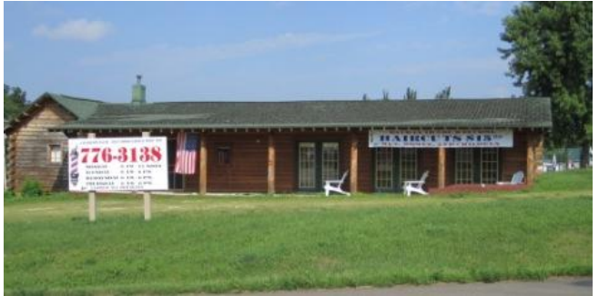
New Barbershop along Highway 11 in Shullsburg

A Barbers Salon – "Blue Door Barber Shop Too" opened at the corner of Highway 11 and 613 Water Street on July 13, 2011 (formerly the Bittersweet). Laura Jenkins is a master barber and haircut specialist. She offers haircutting for men, women and children. All haircuts and hot lather shaves are $15 each.